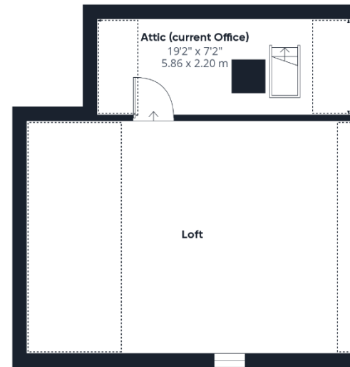
Floor 1 Building 1